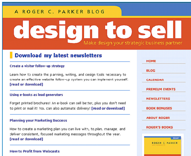
Example of a web page created with WordPress 2.1. New pages appear next to existing sidebar elements, i.e., links, calendar, recent posts, archives, and categories.

If you are comfortable adding new posts to your blog, you will be able to add new pages without incurring outside costs or mastering a long learning curve.